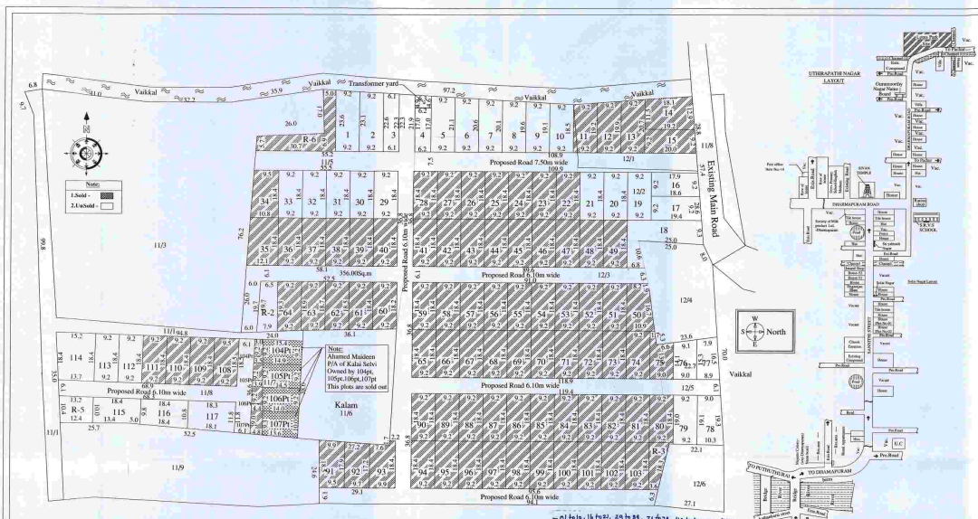
LAYOUT PLAN AS PER FMB (1:500)

COLOR INDEX: PLOT ... ROAD ... RESERVE ... BOUNDARY LINE ... APPLICANT: S. S. DISAKARAJ REGISTERED ENGINEER: S. S. DISAKARAJ, R.E. REGISTRATION NUMBER: 094 Reg. No. 187/02A/2017-2024 No. 17, Floor, Velammal Street, Karaikal - 605 002 Mob. No. 9842922822