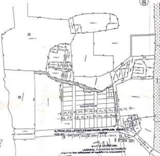
TOPO SKETCH, ROAD NET WORK, LAND SUB DIVISION DETAILS & LOCATION PLAN (NTS)